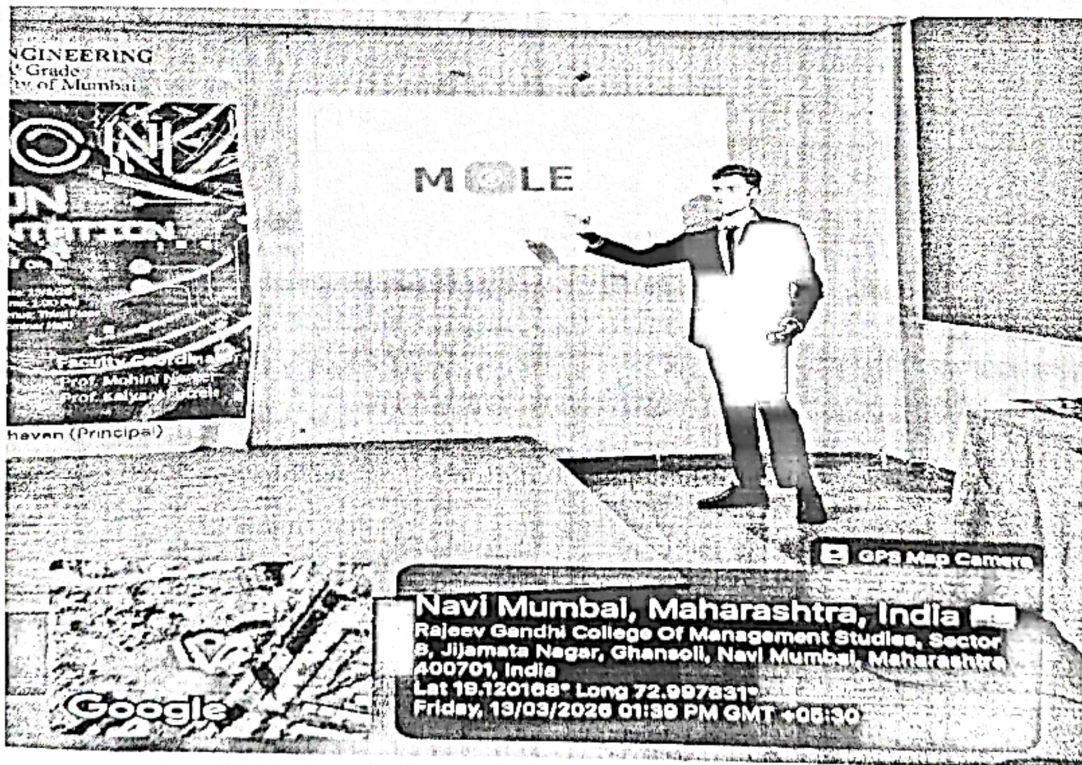
Image 3 : Students presenting their projects during the TechVision event