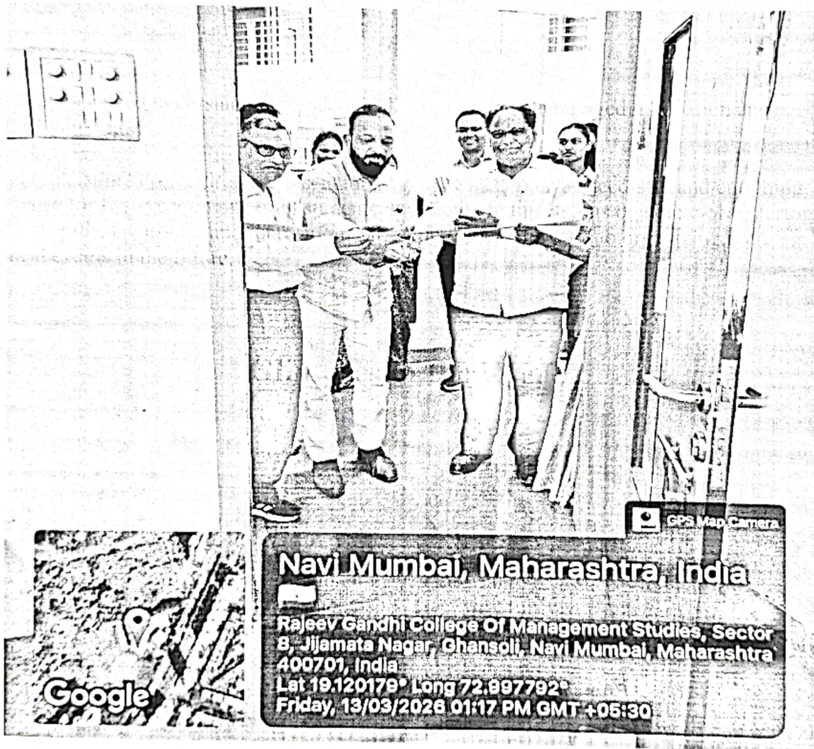
Image 1: Inauguration of the TechVision event by esteemed dignitaries